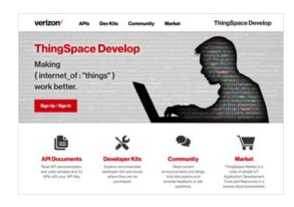
To get started, register on thingspace.verizon.com