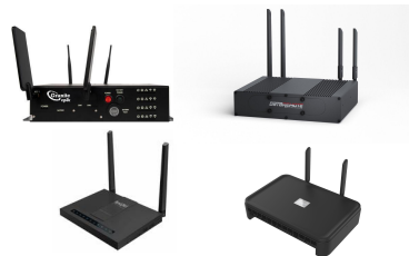
Data Remote/Granite Epik ReadyNet/Ooma AirDial

Use Cases: Elevator, Security Gates, Alarm Panel, Meter Reading, POS, Fax