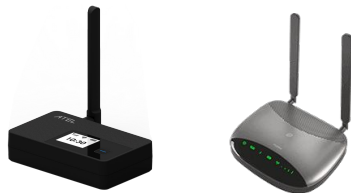
ATEL V810VD/Moxee K500HPEL

Use Cases: 1:1 POTS Replacement Phone, Fax, Blue Light, Elevator